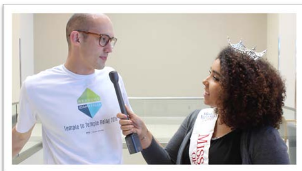
What are you thankful for?

During the month of November, I was thinking of different ways that I could both ask people what they were thankful for as well as share it with others. This sparked the idea of doing a video and asking different people on campus what they were thankful for. It was interesting to see what people were thankful for and to hear the stories behind why they were so grateful for them.