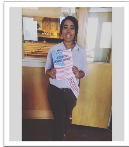
Rexburg Annual Veterans Day Program

Can I just say, Holy Cow where has time gone? It seems like just yesterday I was being crowned in July and now it is almost Christmas time! Well the phrase, "time fly's when you're having fun" definitely applies to this past year. It has been nothing short of fun and excitement. I have had a blast representing not only Hastings, but Nebraska during my time here in Idaho. During the first part of November, I had the opportunity to participate and hand out programs for the Annual Veterans Day Program. This was such a humbling experience because I was able to pay tribute to the veterans that were in attendance of the program and also for those soldiers who are fallen and no longer with us.