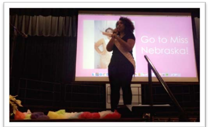
My presentation at Adam's Central Jr/Sr High School